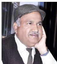
By: Vijay Garg

The companies involved in skill development work are tailoring the training to their needs and trying